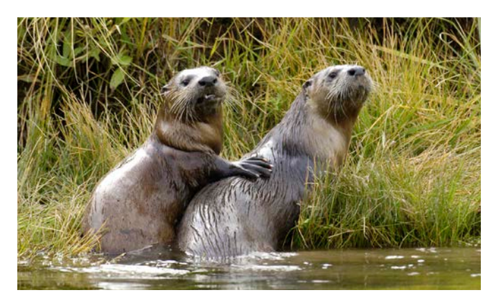
Flow Restoration and Habitat Improvement