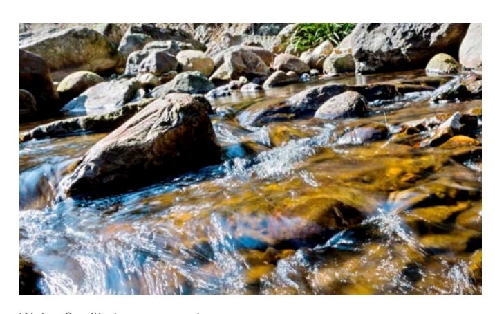
Water Quality Improvement