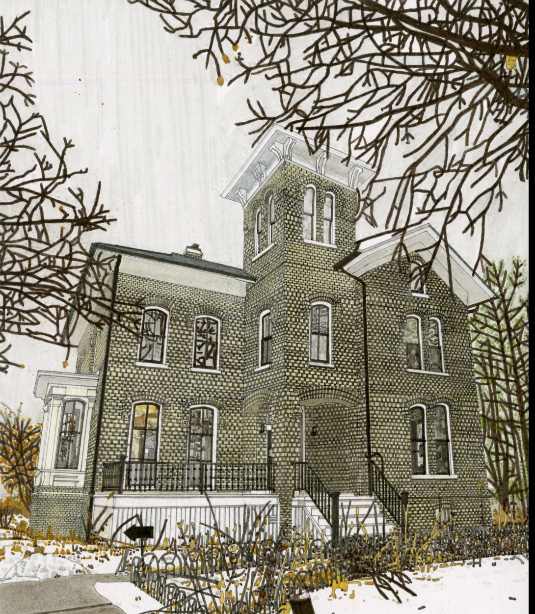
Trailside Nature Museum by RJ Juguilon