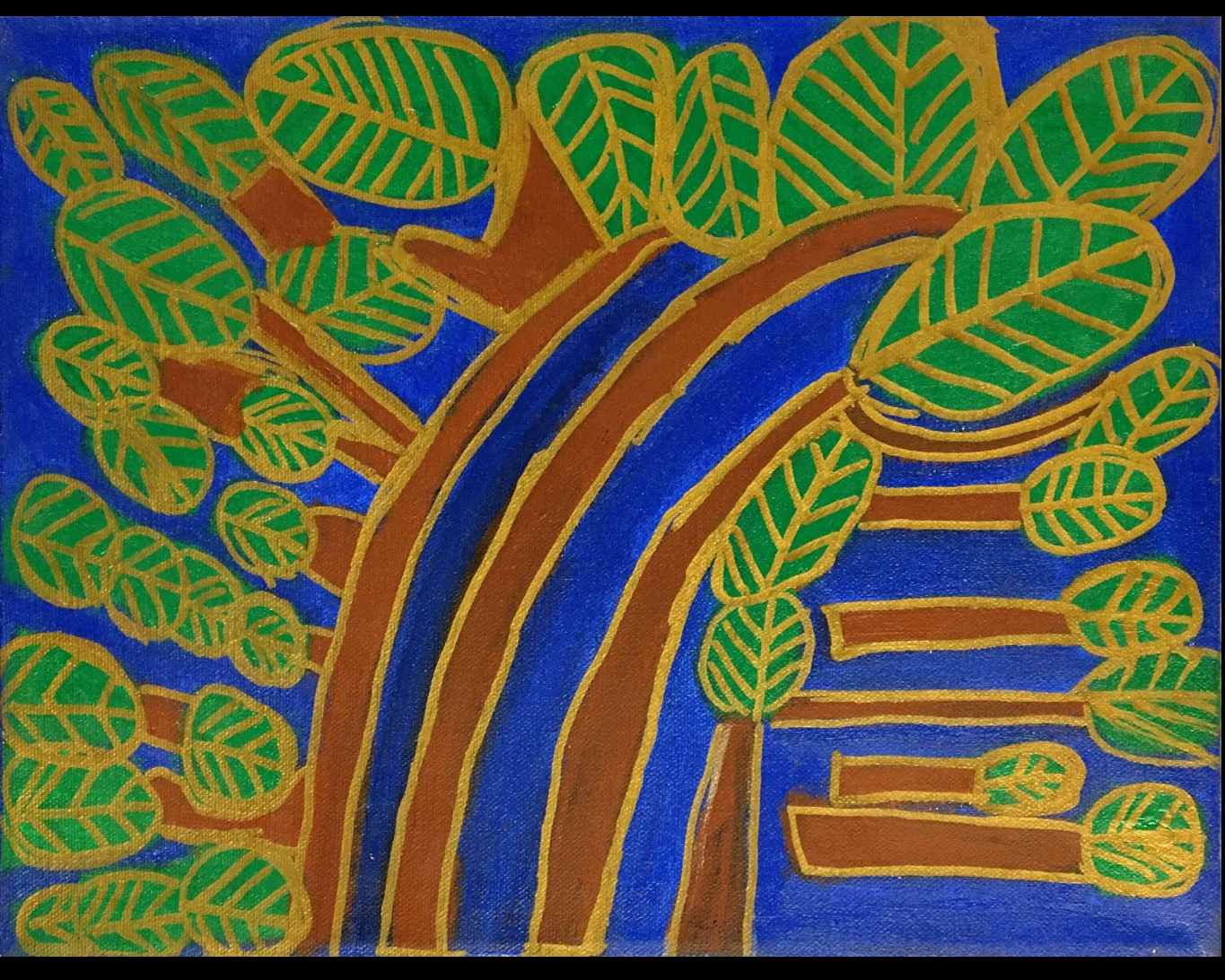
The Forest by Safiya Hameed