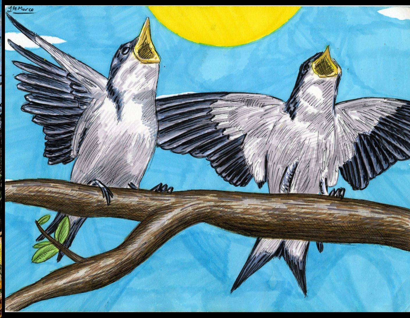
Birds Singing by Louis Demarco