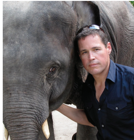
Jeff Corwin, Wildlife Biologist, Conservationist and TV Personality