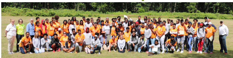
2018 Forest Preserve Experience graduating class at Wampum Lake Woods in Thornton, Ill.

The Forest Preserve Experience Program is a partnership between the Forest Preserves of Cook County and the Housing Authority of Cook County.