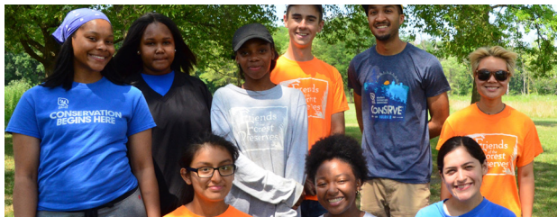
The 2018 Conservation Corps Dan Ryan crew. A grant from the Harry and Jeanette Weinberg Foundation underwrote the crew for the six-week summer program.

The funds covered crew and leader wages, supply and training costs, risk management supplies, member transportation, evaluation and assessment, insurance and worker’s compensation.