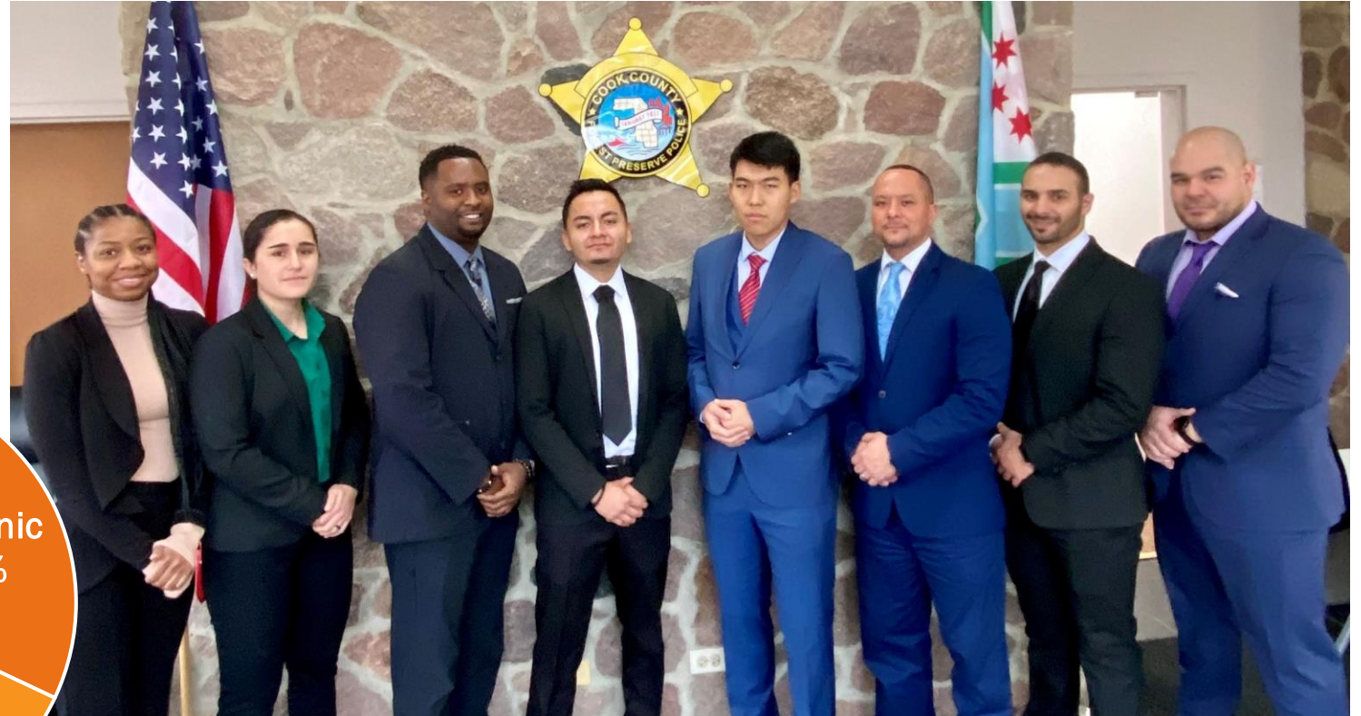
New Hires by Race