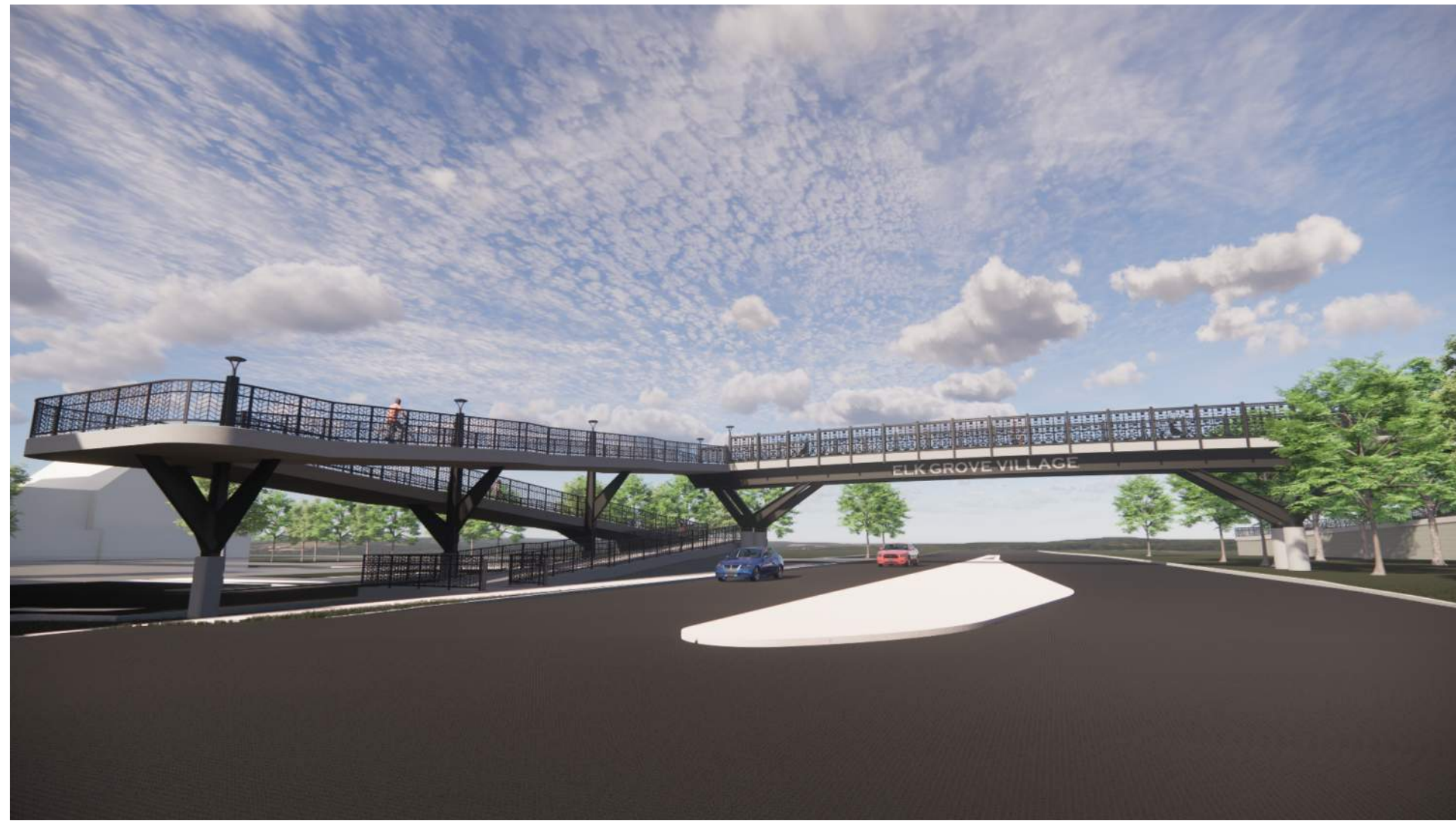
PERSPECTIVE FROM NORTH