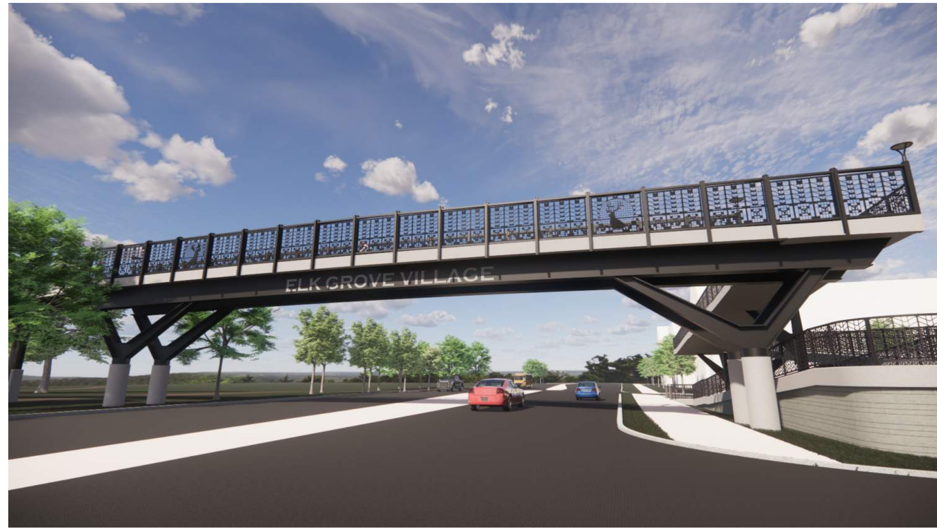
PERSPECTIVE FROM SOUTH