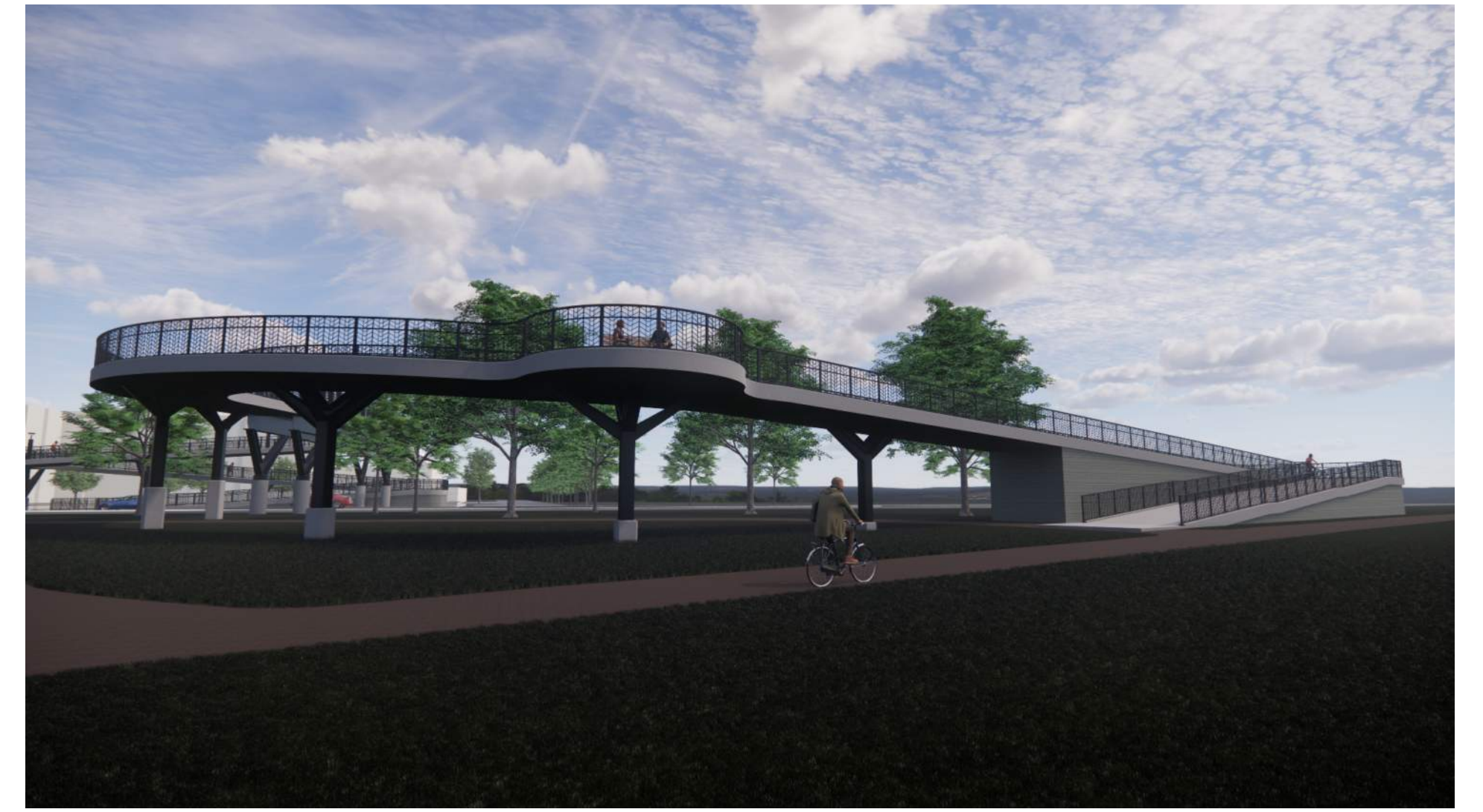
PERSPECTIVE FROM WEST