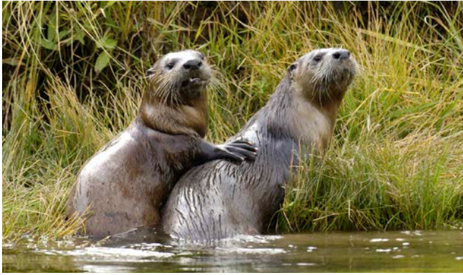
Flow Restoration and Habitat Improvement