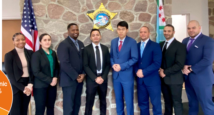
New Hires by Race