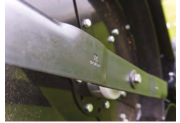
Ease of maintenance, durable cutting decks