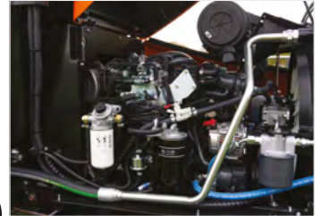
Trustworthy, powerful engine